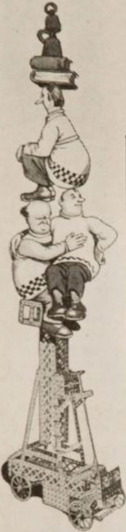
TESTING THE STRENGTH OF A NEW MODEL