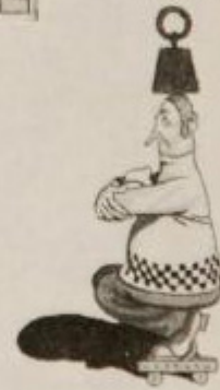
MECCANO TRUCK TESTING