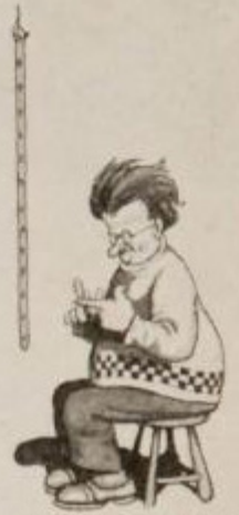
THE ARDUOUS WORK OF THE MECCANO HOLE COUNTER