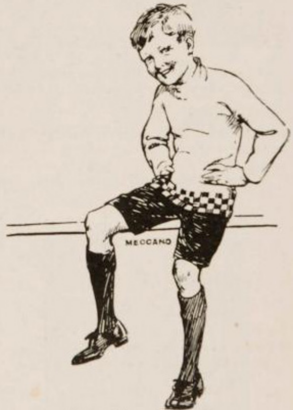
THE MECCANO BOY.

We are, of course, selling what is largely a boys' hobby, and in order to make our advertisements more appealing to boys, we have always made a strong feature of introducing into them attractive drawings of boys who are obviously enjoying the pleasure of building or playing with Meccano models.