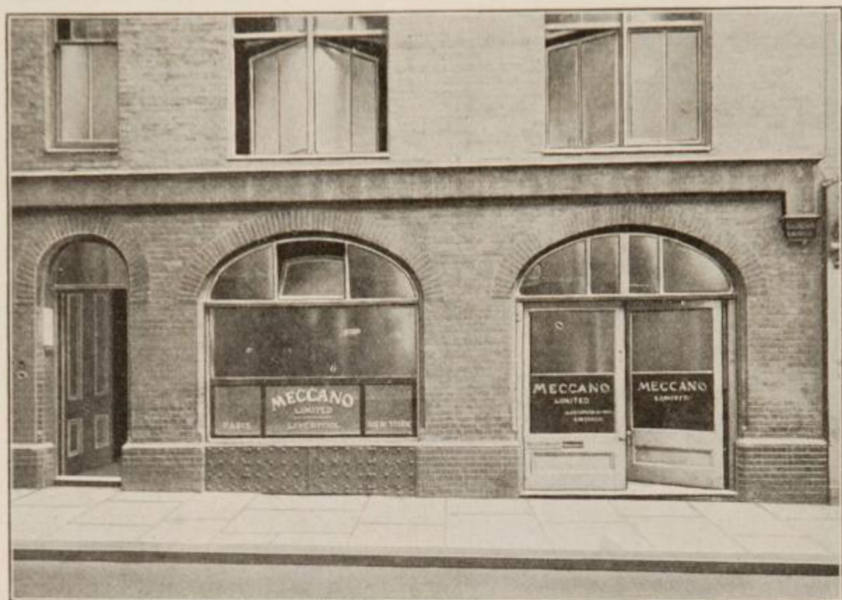
OUR LONDON OFFICE AND STOCK ROOMS.

The position in regard to office and warehouse accommodation is probably worse in London than in any other city, and we recently found ourselves in the unhappy position of being liable to be turned out of our London premises at short notice. We have solved the problem by buying the entire building in which our offices and warehouse are located, and we are thus able to ensure a continuance of our excellent service to London dealers, and the rapid distribution of Meccano products to all towns within range of London.