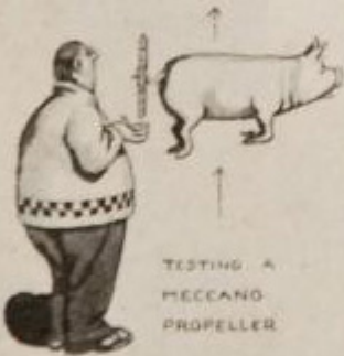
TESTING A MECCANO PROPELLER