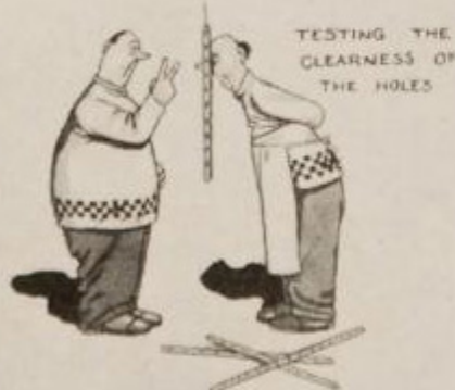
TESTING THE CLEARNESS OF THE HOLES

Mr. W. Heath Robinson's conception of the way in which Meccano is manufactured and tested.