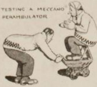
TESTING A MECCANO PERAMBULATOR