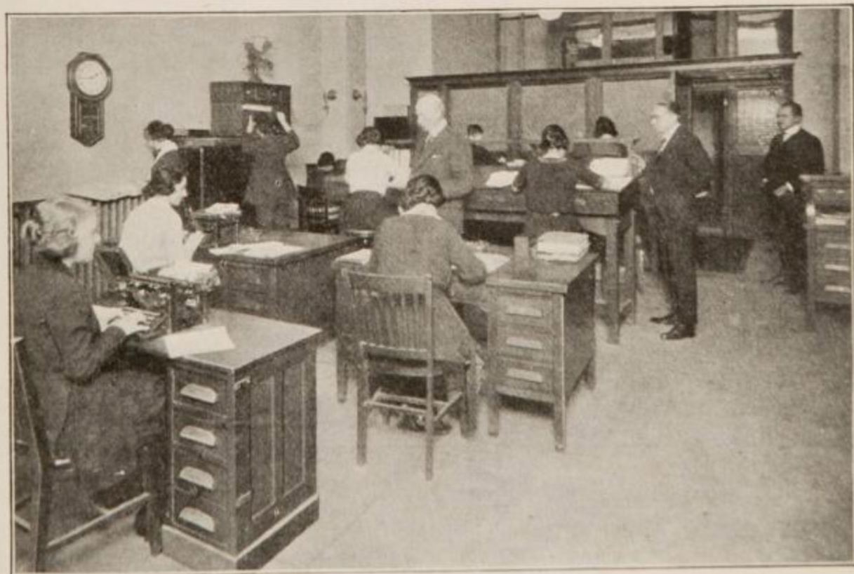
A SECTION IN OUR NEW YORK OFFICE.